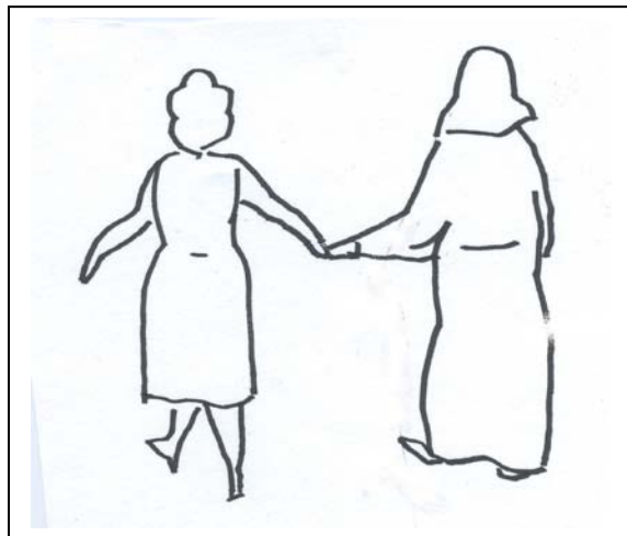
Sketch by Bill Binzen