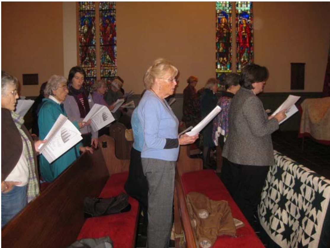
WORLD DAY OF PRAYER SERVICE